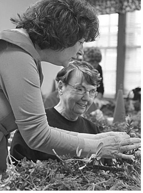
Master Gardeners assist participants of Creating a Tabletop Tree workshop.

The Master Gardeners supply all the greenery, decorative elements, and forms; the participants need to bring their own gloves, scissors and/or clippers. Depending upon the class, everyone will create either a unique wreath or tabletop tree from scratch, using fresh greens and natural materials. "Our Master Gardeners will